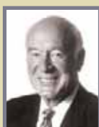
Cecil D. Andrus Gallatin Group